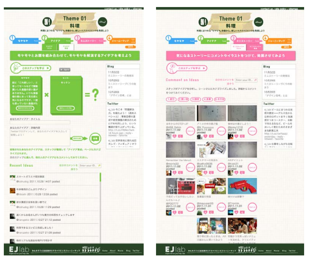
Figure 2 Experience Journey Lab.